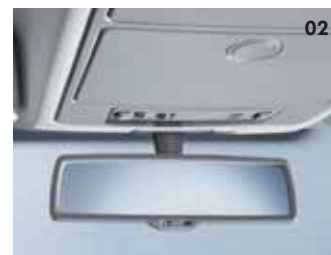
02 Automatic dimming interior rear-view mirror (Convenience pack).

The importance of comfort and convenience cannot be over-emphasised. Choose from this range of factory-fitted options to create an interior that meets your individual needs, and makes life just that little bit more comfortable and convenient. 2Zone electronic climate control, electric sunroof or Convenience pack, these luxuries are designed to help you relax and take the stress out of driving, adding not only a touch of luxury, but also providing invaluable practical assistance.