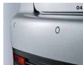
04 Rear parking sensors.

Safety and security have to be a primary consideration, for only when you are feeling totally safe and protected can you completely relax. For example, the rear parking sensors take the worry out of reversing into tight spaces, enabling you to enjoy the driving experience so much more.