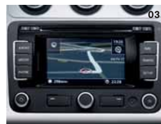
03 RNS 315 touch-screen navigation/radio system.

When it comes to in-car entertainment systems and communications packages, those looking to install a technologically advanced or upgraded system are spoilt for choice. Whether you require the latest touch-screen navigation system or digital radio receiver, these factory-fitted options provide the ultimate in advanced electronics, state-of-the-art technology and connectivity.