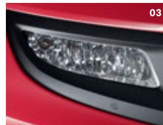
03 Front fog lights with static cornering function.

The exterior styling of a car is not only an expression of its personality, but makes a powerful statement about your own individuality and taste. These factory-fitted options provide an easy and effective way to create a striking visual appearance with great aesthetic appeal, whilst enjoying some important practical benefits. From special paint to front fog lights, choose the options best suited to your needs and enhance not only your Polo's exterior looks, but your driving experience too.