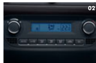
02 Electronic climate control air conditioning.

The importance of comfort and convenience cannot be over-emphasised. Choose from this range of factory-fitted options to create an interior that meets your individual needs, and makes life just that little bit more comfortable and convenient. From electronic climate control air conditioning to a Winter pack, these essential luxuries are designed to help you relax and take the stress out of driving, adding not only a touch of luxury, but also providing invaluable practical assistance.