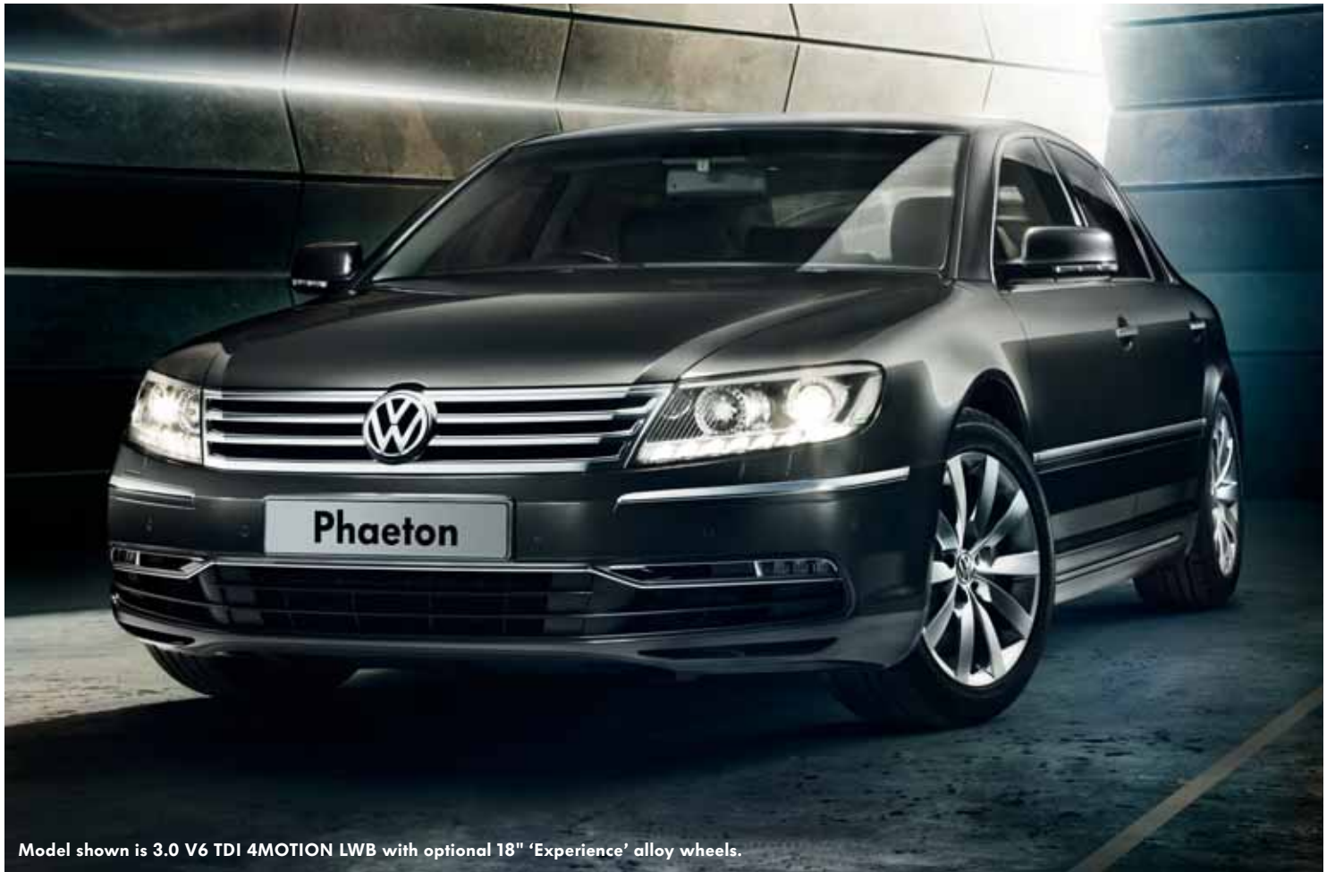
Model shown is 3.0 V6 TDI 4MOTION LWB with optional 18" 'Experience' alloy wheels.