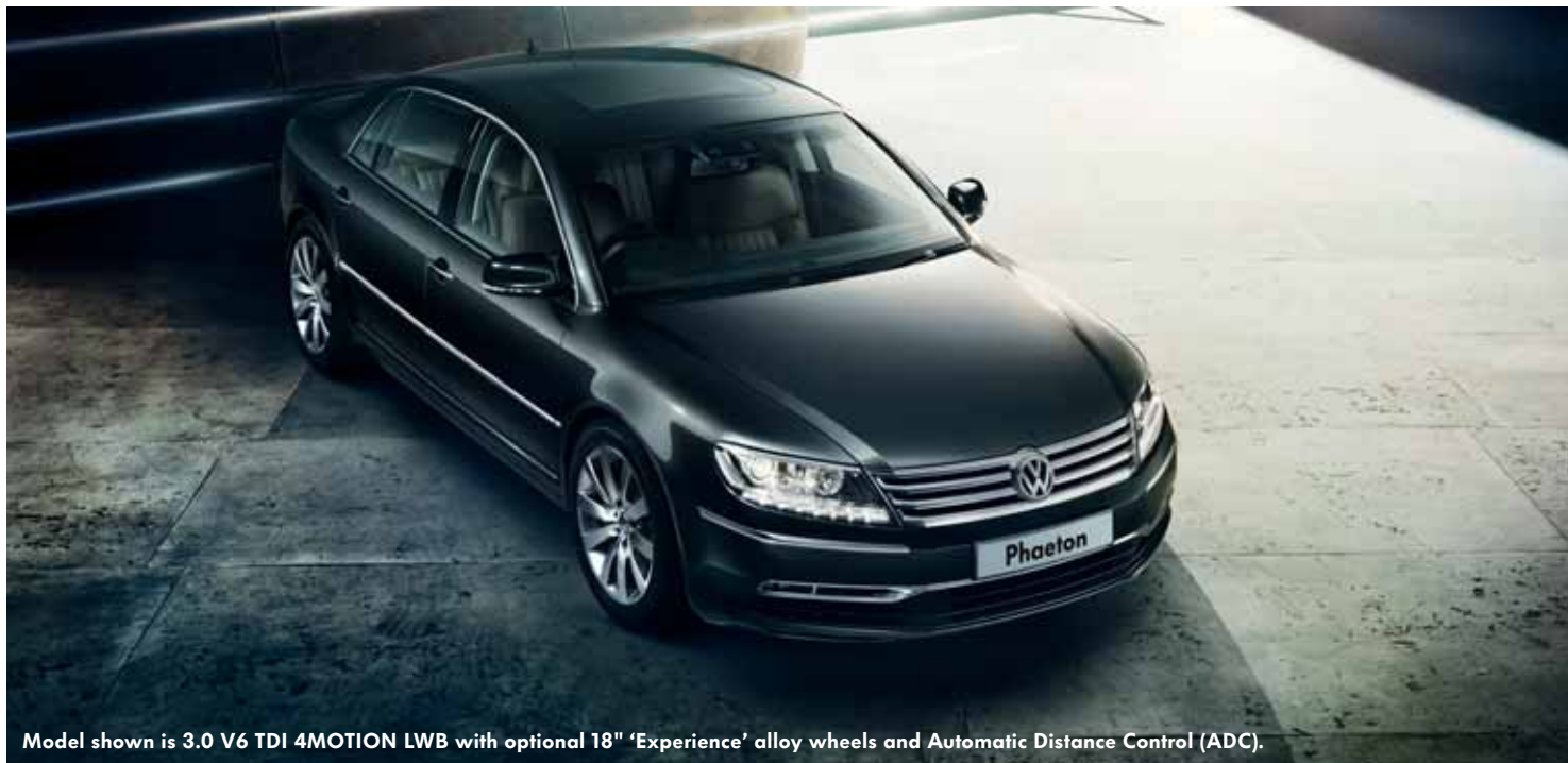
Model shown is 3.0 V6 TDI 4MOTION LWB with optional 18" 'Experience' alloy wheels and Automatic Distance Control (ADC).

The maximum power output figures are quoted in PS (or Pferdestärke, which is the metric equivalent of horsepower). To convert from metric to imperial horsepower, divide the PS figure by 1.0139.