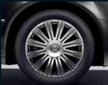
'Performance' 8½J x 18 alloy wheels.

The exterior styling of a car is not only an expression of its personality, but makes a powerful statement about your own individuality and taste. Choose the options best suited to your needs and enhance not only your Phaeton's exterior looks, but your driving experience too.