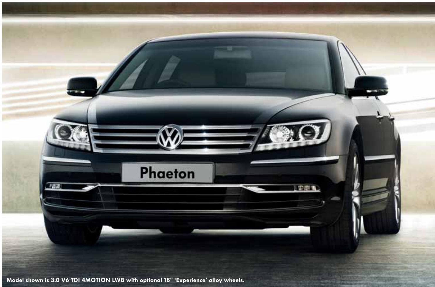
Model shown is 3.0 V6 TDI 4MOTION LWB with optional 18" 'Experience' alloy wheels.