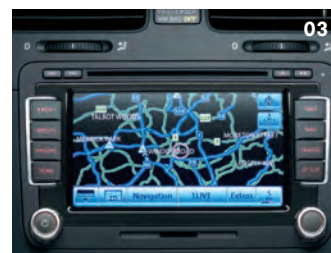
03 RNS 510 DVD touch-screen navigation/radio system.

When it comes to in-car entertainment systems and communications packages, those looking to install a technologically advanced or upgraded system are spoilt for choice. Whether you require upgraded acoustics or the latest DVD touch-screen navigation/radio system, these factory-fitted options provide the ultimate in advanced electronics, state-of-the-art technology and connectivity. Choose the system that best meets your needs, then sit back and enjoy the benefits.