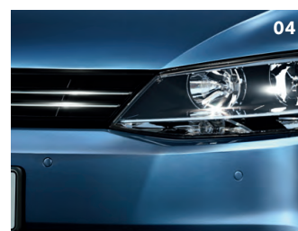
04 Parking sensor pack.

Safety and security have to be a primary consideration, for only when you are feeling totally safe and protected can you completely relax. Whether you are looking to ensure the safety of your passengers, enhance rear safety or make life just that little easier, this range of safety and security features will help you protect passengers and make your new Jetta more secure, enabling you to enjoy the driving experience so much more.