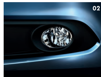
02 Front fog lights.

The exterior styling of a car is not only an expression of its personality, but makes a powerful statement about your own individuality and taste. These factory-fitted options provide an easy and effective way to create a striking visual appearance with great aesthetic appeal, while enjoying some important practical benefits. From heat insulating tinted glass to front fog lights, choose the options best suited to your needs and enhance not only your new Jetta's exterior looks, but your driving experience too.