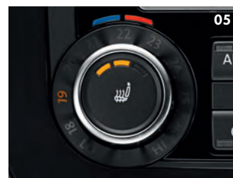
05 Heated front seats ('Vienna' leather upholstery).

The interior of your car is all about aesthetics and luxury, leather upholstery enables you to create a sumptuous interior that is tasteful, elegant and attractive, meeting your individual needs perfectly, and providing the highest levels of comfort and driving pleasure. Sit back, relax and enjoy your surroundings.