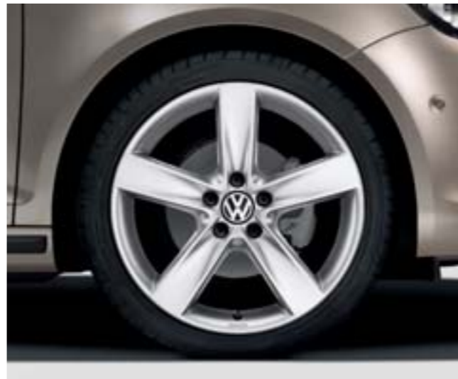
Volkswagen Genuine Topaz alloy wheel

Wheel size: 7.5J x 18" Tyre size: 225/40 R18