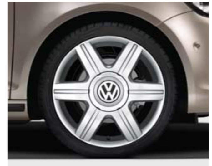
Volkswagen Genuine Contur alloy wheel