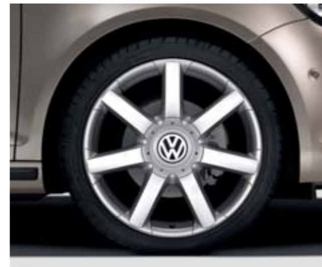
Volkswagen Genuine Namib alloy wheel