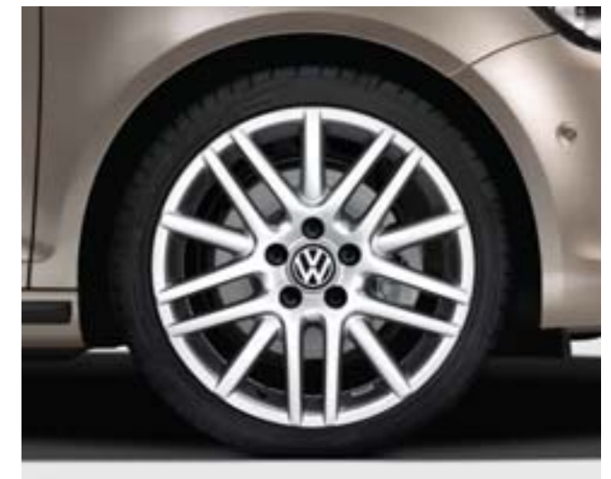
Volkswagen Genuine Exis alloy wheel