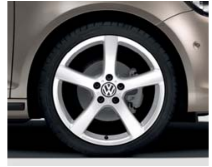
Volkswagen Genuine Goal alloy wheel

Wheel size: 7.5J x 17" Tyre size: 205/50 R17 Wheel size: 7.5J x 18" Tyre size: 225/40 R18