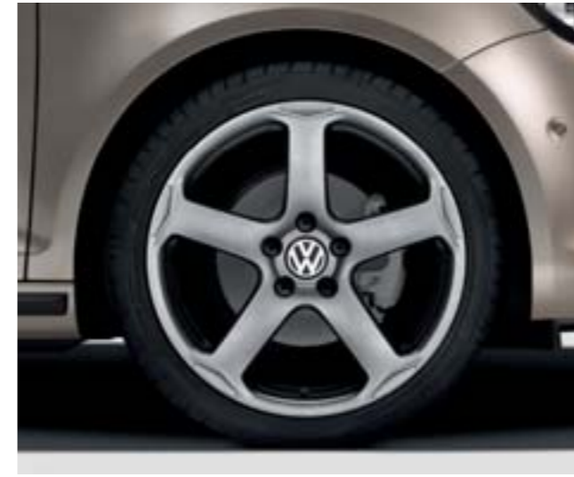
Volkswagen Genuine Karthoum alloy wheel

Wheel size: 7J x 17" Tyre size: 225/45 R17 Wheel size: 8J x 18" Tyre size: 225/40 R18