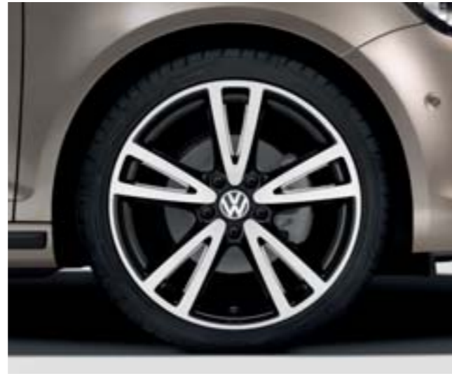
Volkswagen Genuine Vision alloy wheel

Wheel size: 7J x 17" Tyre size: 225/45 R17 Wheel size: 7.5J x 18" Tyre size: 225/40 R18