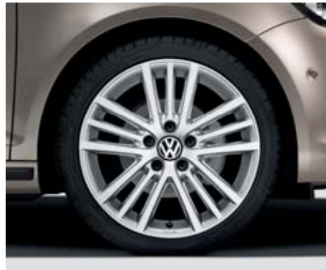
Volkswagen Genuine Onyx alloy wheel

Wheel size: 7J x 17" Tyre size: 225/45 R17