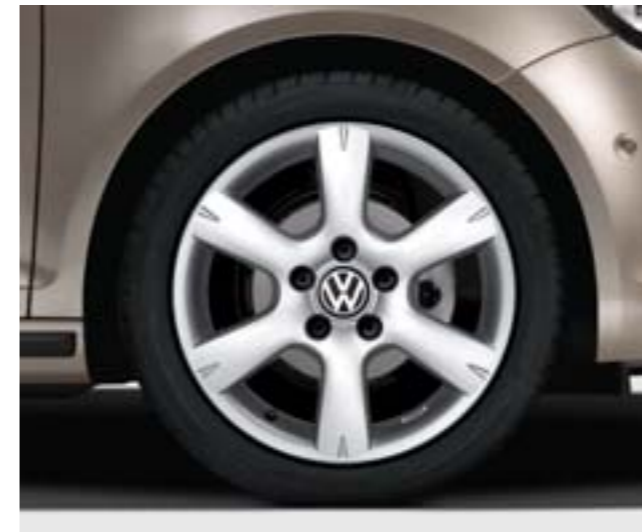
Volkswagen Genuine Tangis alloy wheel

Whether you opt for sporty Vision wheels or stylish Onyx ones, they're sure to make an impact. Speak to a member of staff about our choice of wheels today.