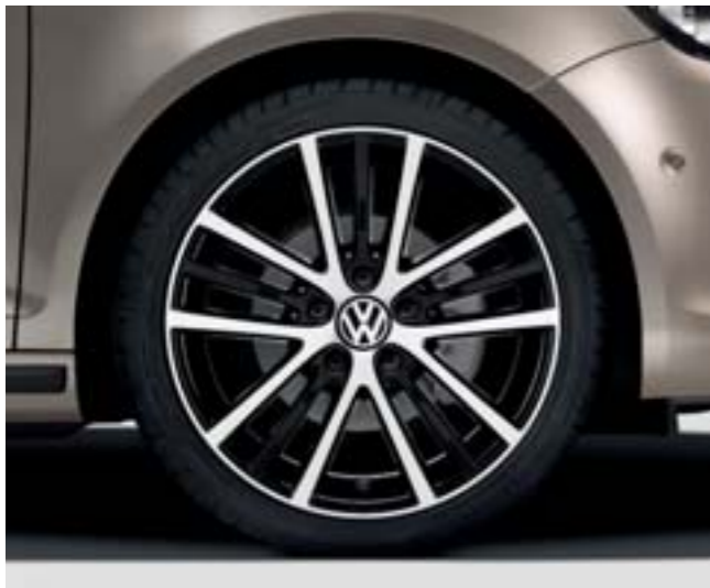
Volkswagen Genuine Onyx alloy wheel

Wheel size: 7J x 17" Tyre size: 225/45 R17