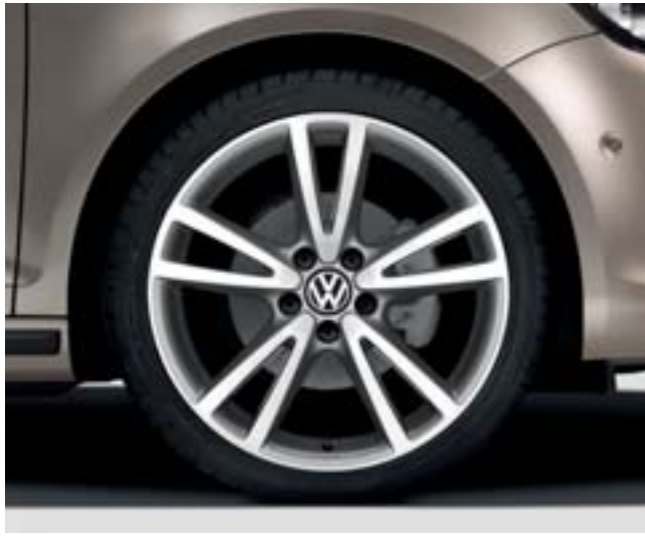
Volkswagen Genuine Vision alloy wheel

Wheel size: 7J x 17" Tyre size: 225/45 R17