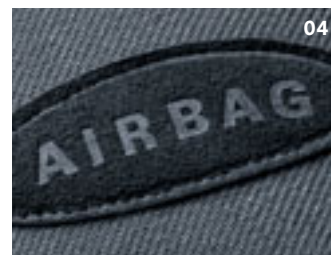
04 Side airbags.

Safety has to be a primary consideration, for only when you are feeling totally safe and protected can you completely relax. This choice of safety features will help you protect passengers and keep your Fox stay safely on course, enabling you to enjoy the driving experience so much more.