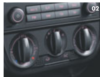
02 'Climatic' semi-automatic air conditioning.

The importance of comfort and convenience cannot be over-emphasised. Choose from this range of factory-fitted options to create an interior that meets your individual needs, and makes life just that little bit more comfortable and convenient. From 'Climatic' semi-automatic air conditioning to easy entry sliding seats, from a sunroof to a Luxury or Winter pack, these essential luxuries are designed to help you relax and take the stress out of driving, adding not only a touch of luxury, but also providing invaluable practical assistance.