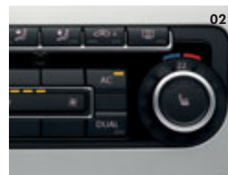
02 2Zone electronic climate control.

The importance of comfort and convenience cannot be over-emphasised. Choose from this range of factory-fitted options to create an interior that meets your individual needs, and makes life just that little bit more comfortable and convenient. 2Zone electronic climate control, wind deflector or winter pack, these essential luxuries are designed to help you relax and take the stress out of driving, adding not only a touch of comfort, but also providing invaluable practical assistance.