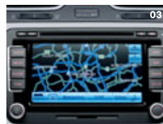
03 RNS 510 DVD touch-screen navigation/radio system.

When it comes to in-car entertainment systems and communications packages, those looking to install a technologically advanced or upgraded system are spoilt for choice. Whether you require concert hall acoustics, the latest navigation system or a DAB digital radio receiver, these factory-fitted options provide the ultimate in advanced electronics, state-of-the-art technology and connectivity. Choose the system that best meets your needs, then sit back and enjoy the benefits.